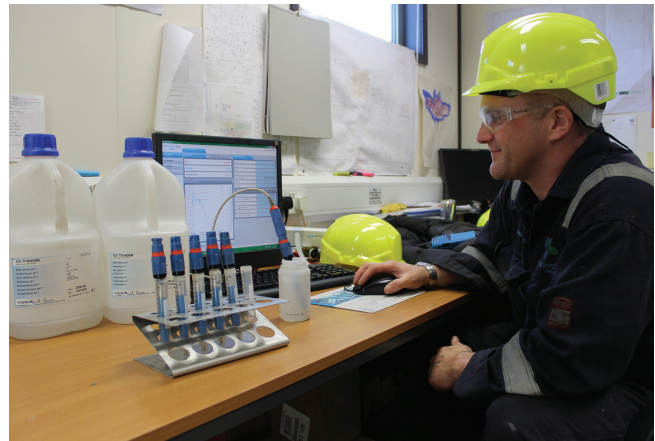
Sensors are calibrated away from the process under constant conditions.