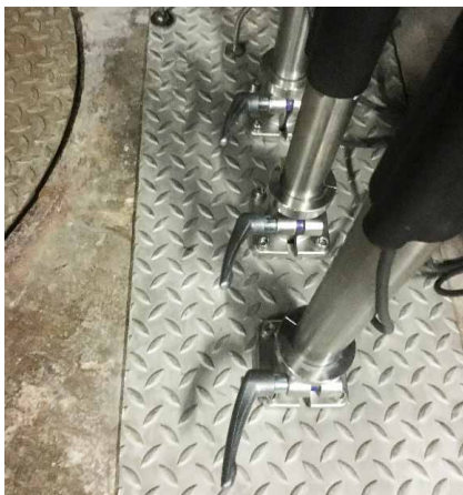
Three sensors in installed state