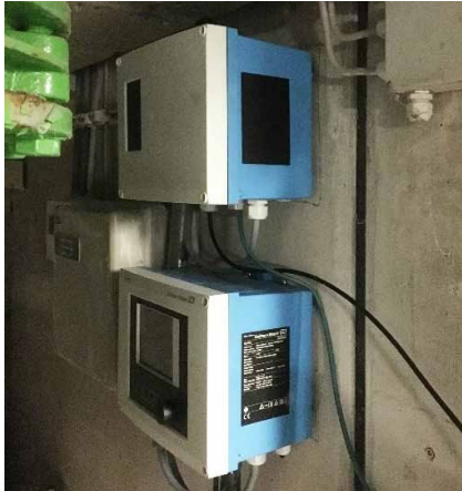
Liquiline CM444 and Modbus Edge Device