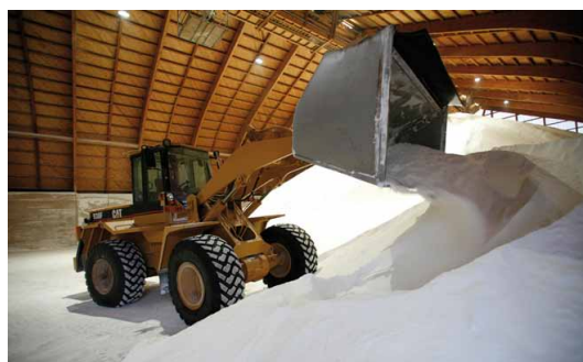
Ensuring safe transport: Road salt at the Schweizerhalle site

With Netilion, Swiss Saltworks has taken a further step towards digitalization. With the help of the Smart Systems App, the Netilion Smart System enables permanent monitoring of the industrial waste water.